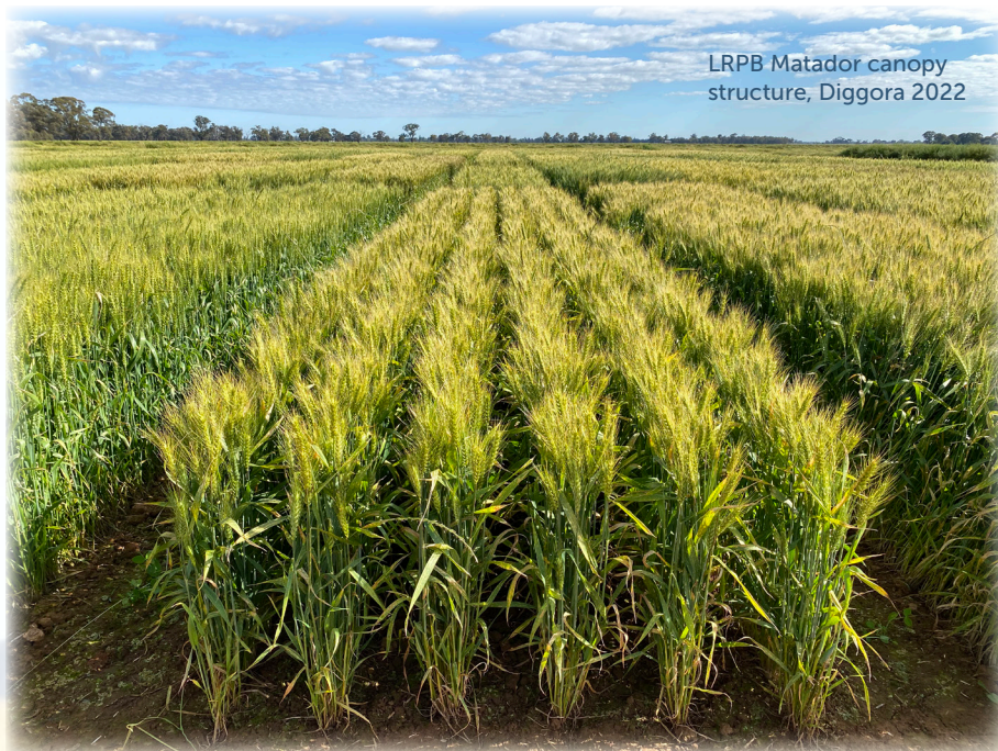
LRPB Matador canopy structure, Diggora 2022

LRPB Matador, mid spring, high yielding Scepter type with improved canopy and disease resistance