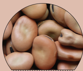
PBA Amberley ®

Source: NVT. Data derived from 25 rainfed trials in SA, Vic and th NSW in 2016–2018