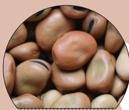
PBA Samira ®