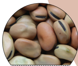
PBA Zahra ®